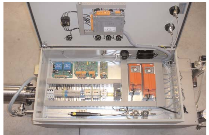
Modular design in every detail