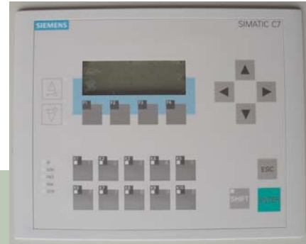
Panel - easy to handle - all important system messages in view