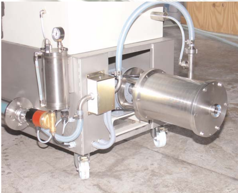
MÜGROMIX+ with axial mixing head type MÜ3