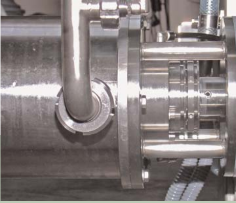
Mixing head seals - double acting lip seal - double acting stuffing box seal - double acting mechanical seal