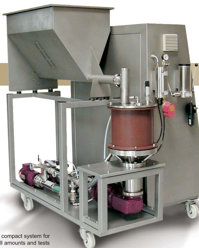
TOMIX compact system for small amounts and tests